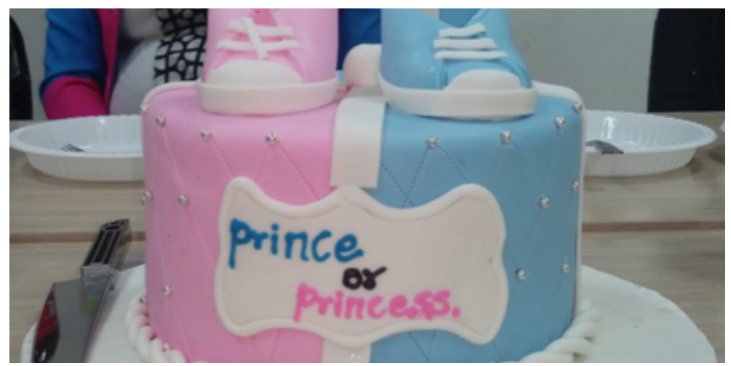
The delicious cake for the mums-to-be

To all expectant mothers at SONAM, we congratulate you and wish you all the best in this new chapter of life's journey.