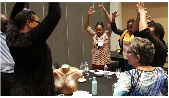
Instructors prepare participants to administer a breast exam