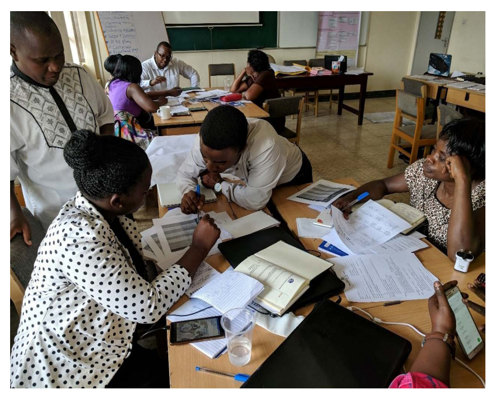
Participants from Uganda nurses and midwives associations take part in group activities during the training at AKU Kampala on May 18,2018

"I hope the workshop will encourage active participation and increased ownership of various association activities by members through follow-up on achieving expected results and coming up with remedial measures to bottlenecks in implementation." Mr Sospeter Ndaba, SONAM East Africa Project Manager