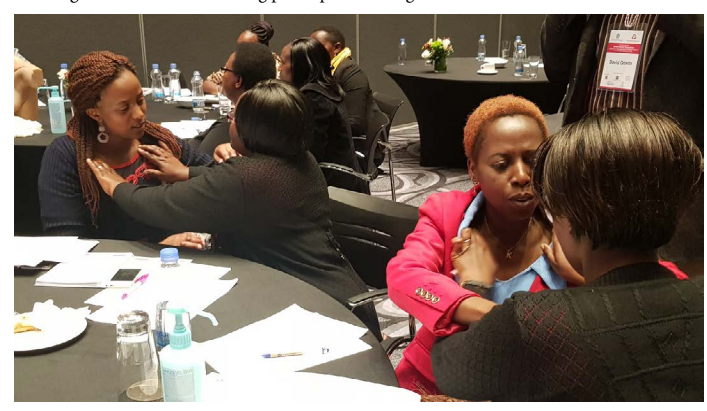
Participants going through an examination session