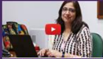
SoTL Grants At AKU