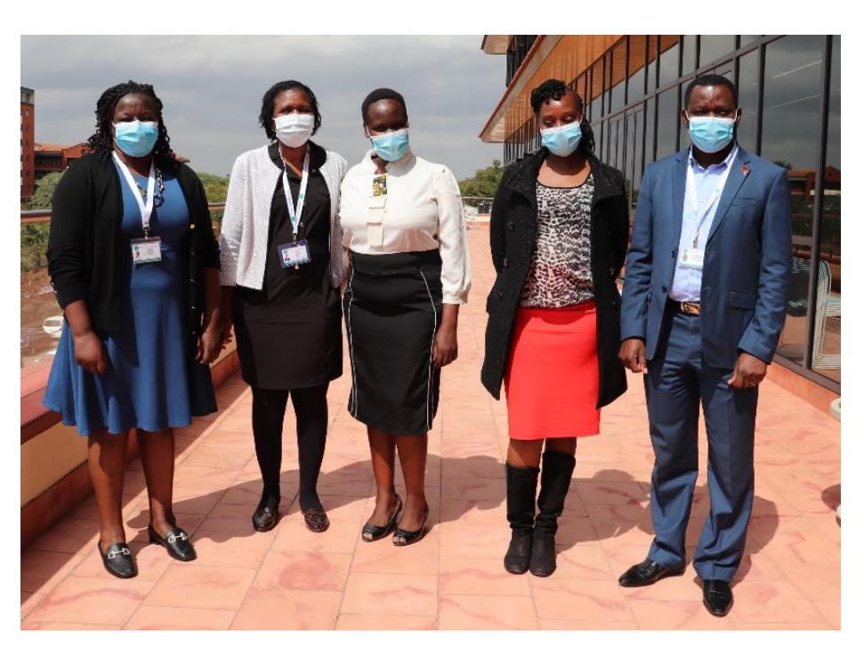
Two Midwifery students, Class of June 2023 with three faculty