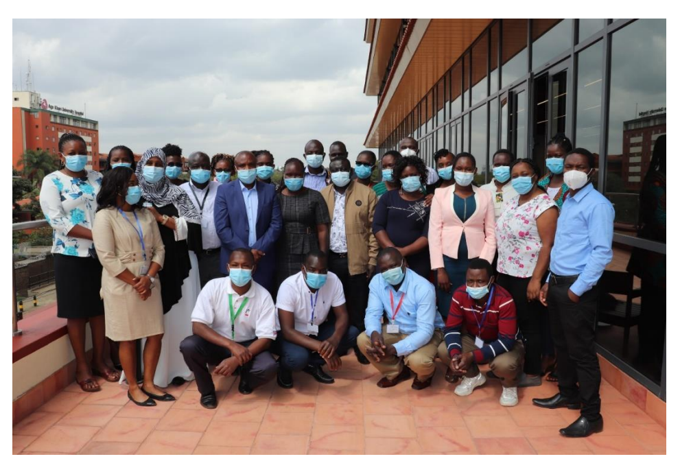
School of Nursing and Midwifery KPFP scholarship recipients