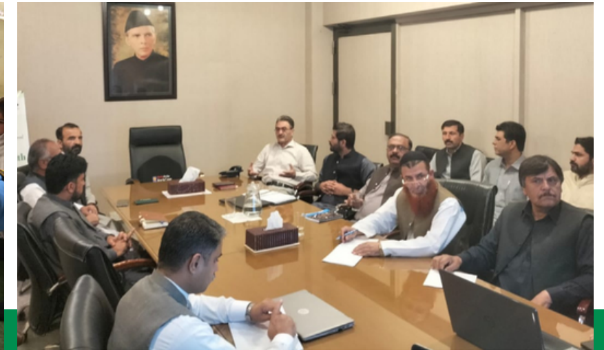
Improvement of the Learning Design and Teaching-Learning Processes in Balochistan