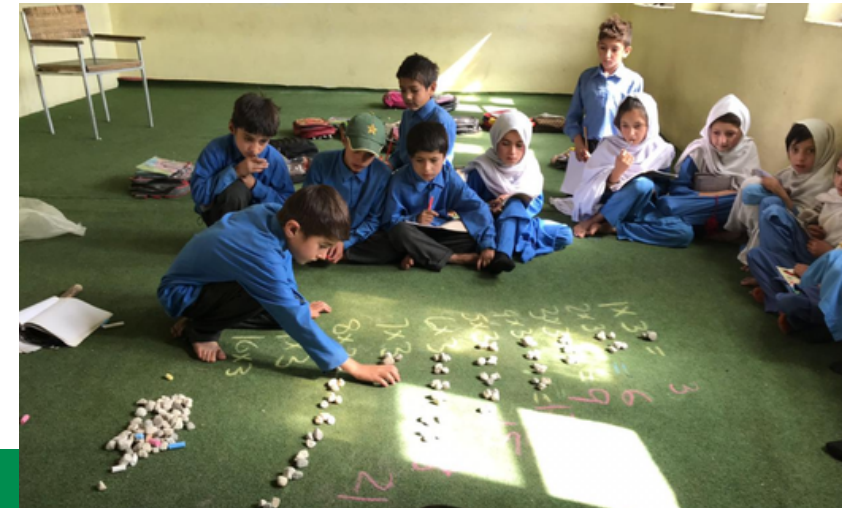
Raise Awareness and Inspire Action on Environmental Protection in Khyber Pakhtunkhwa