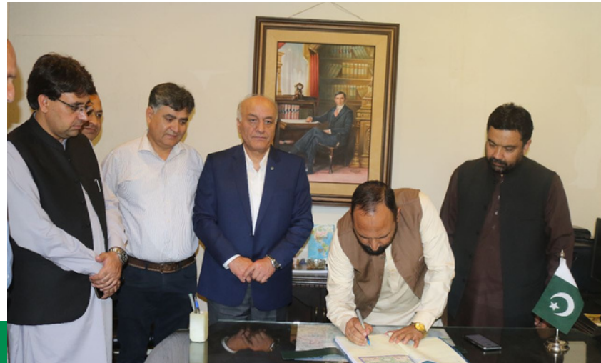
Education Fellows: Improving Quality of Pedagogy in Gilgit-Baltistan

AKU-IED secured a number of research and development project grants for implementation across Pakistan.