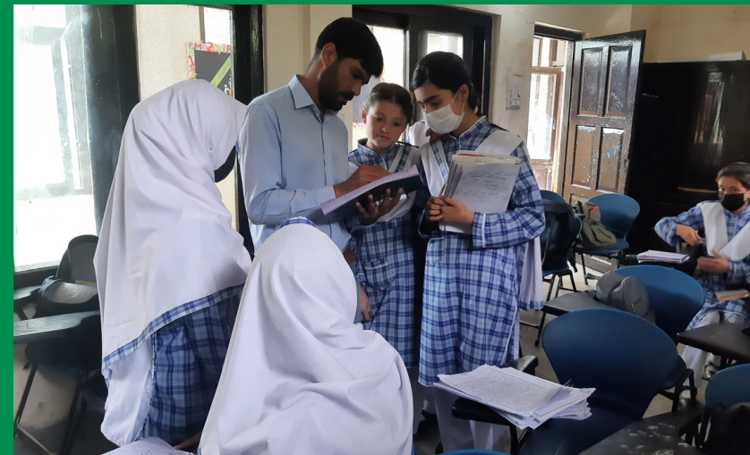
Education for Prosperity in Khyber Pakhtunkhwa