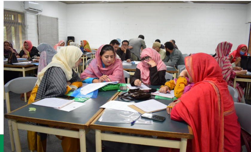
Capacity building of government science teachers in Gilgit-Baltistan