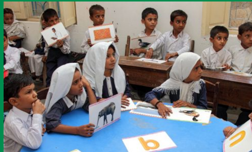
Data and Research in Education (DARE) programme in Pakistan