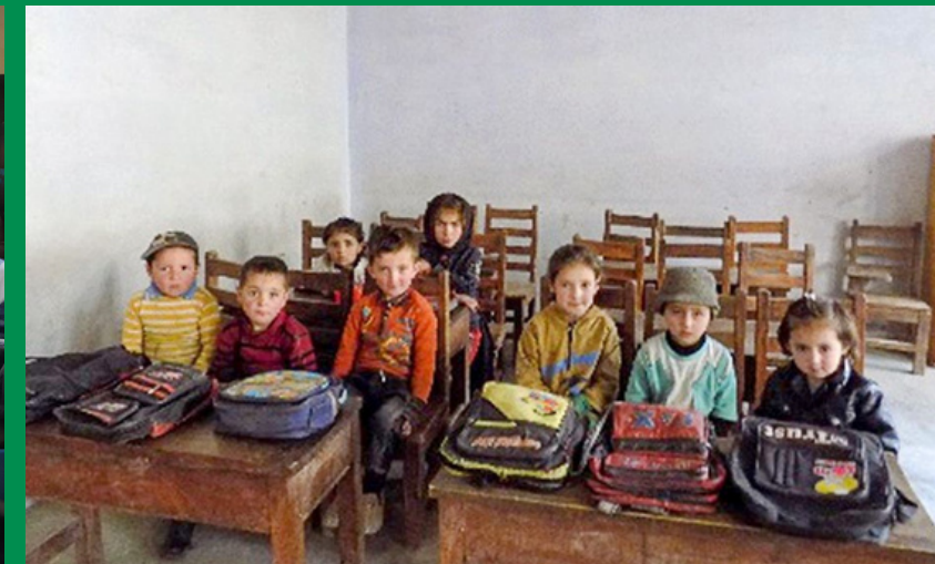
Batswat School Improvement Programme in Immit Valley