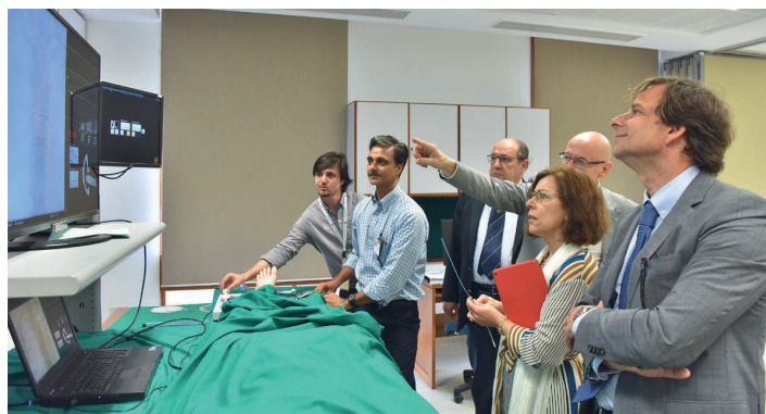
A delegation from Portugal accompanied by Portugal Ambassador