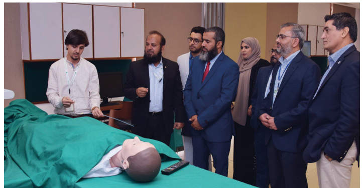
A delegation from Oman