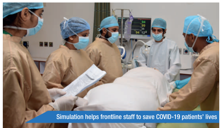
Simulation helps frontline staff to save COVID-19 patients' lives

Weblink: https://www.aku.edu/news/Pages/News_Details.aspx?nid=NEWS-002243