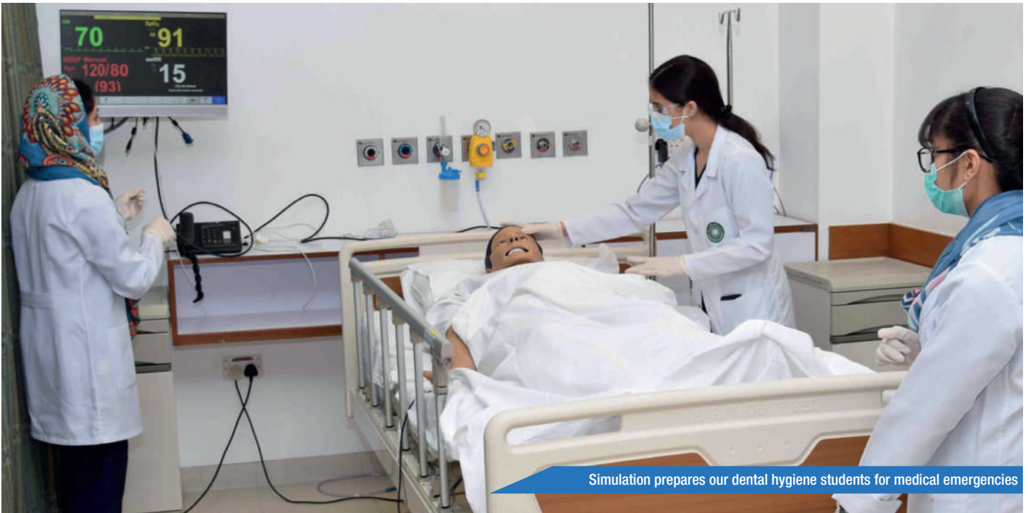
Simulation prepares our dental hygiene students for medical emergencies