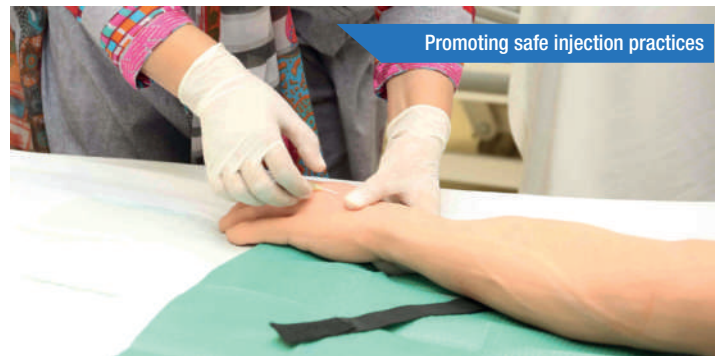
Promoting safe injection practices

Weblink: https://www.aku.edu/news/Pages/News_Details.aspx?nid=NEWS-002167