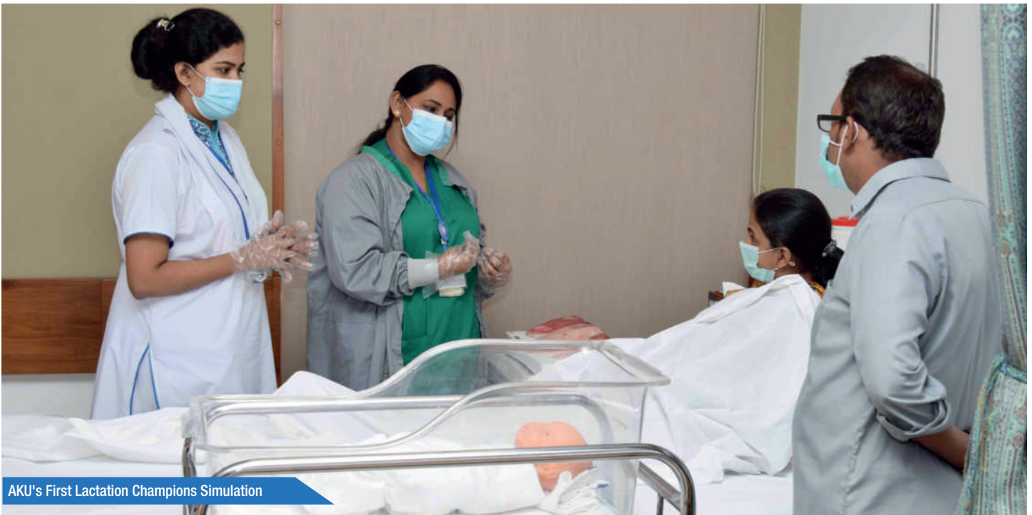
AKU's First Lactation Champions Simulation

The Breastfeeding Champions Course was conducted by the International Breastfeeding Lactation consultants in partnership with CIME for the very first time for AKU nurses and midwives working in the service line 4 and 5, and secondary hospitals. The aim was to prepare learners