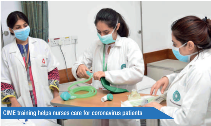
CIME training helps nurses care for coronavirus patients

The month of May saw a collaboration between CIME and the Nursing Education Services (NES) featuring a four-day training for AKUH nurses and trainee nurse interns to take care of acutely ill coronavirus patients admitted in ICUs.