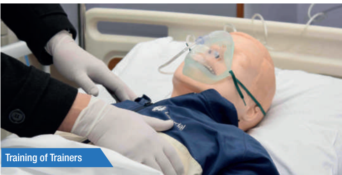
Training of Trainers

Weblink: https://www.aku.edu/news/Pages/News_Details.aspx?nid=NEWS-002161