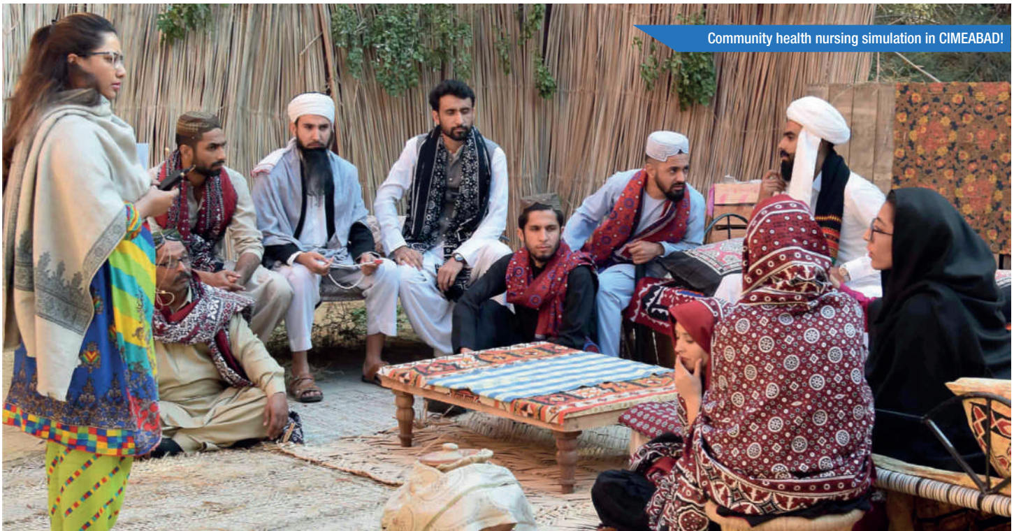
Community health nursing simulation in CIMEABAD!

The CIME courtyard was transformed into the setting of a local village in order to simulate a real-life dwelling of individuals from rural areas. It was organised for the post-RN BScN nursing students. The idea behind “CIMEABAD” was born when it became evident that the traditional classroom teaching would not provide the entire experience of the harsh discomforts that accompany rural