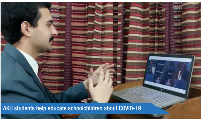
AKU students help educate schoolchildren about COVID-19

Weblink: https://www.aku.edu/news/Pages/News_Details.aspx?nid=NEWS-002217