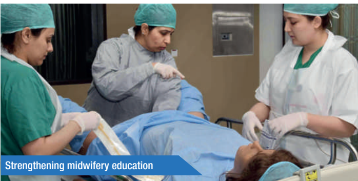
Strengthening midwifery education

Weblink: https://www.aku.edu/news/Pages/News_Details.aspx?nid=NEWS-002162