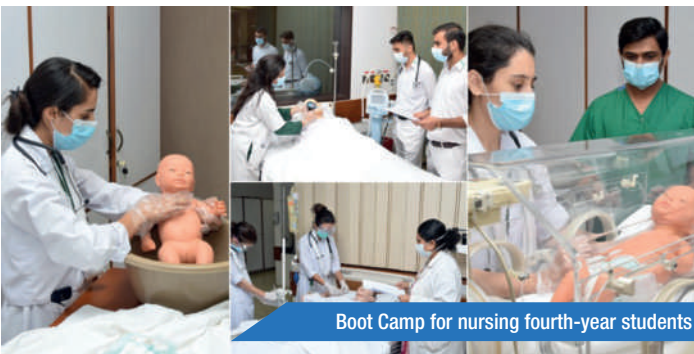
Boot Camp for nursing fourth-year students

Weblink: https://www.aku.edu/news/pages/News_Details.aspx?nid=NEWS-002421