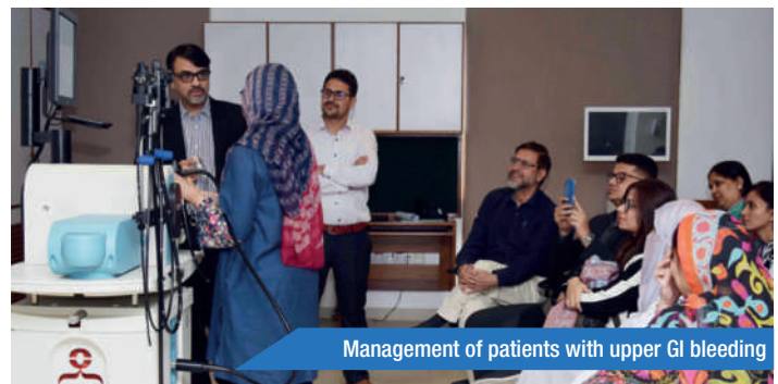
Management of patients with upper GI bleeding

Weblink: https://www.aku.edu/news/Pages/News_Details.aspx?nid=NEWS-002164