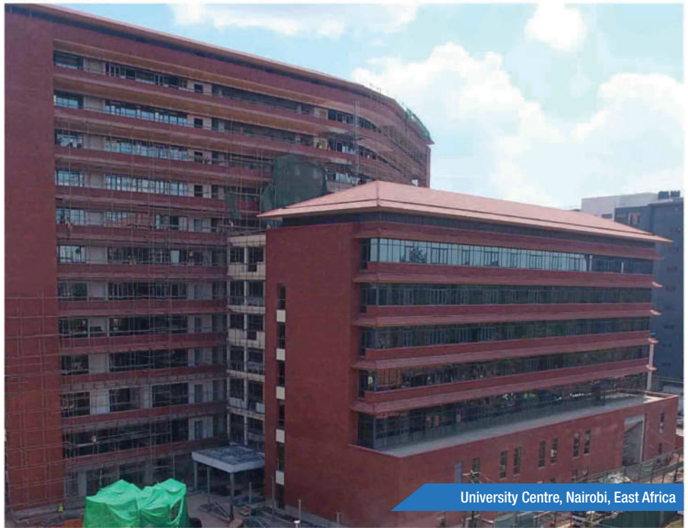
University Centre, Nairobi, East Africa