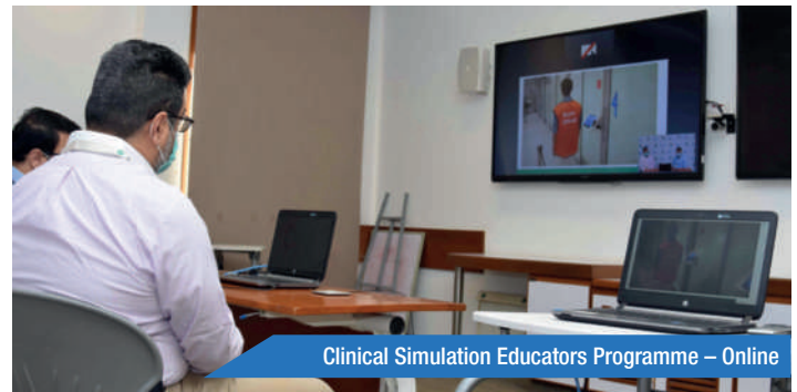
Clinical Simulation Educators Programme – Online

Weblink: https://www.aku.edu/news/pages/News_Details.aspx?nid=NEWS-002422