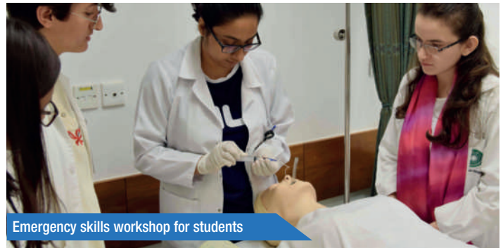
Emergency skills workshop for students

Weblink: https://www.aku.edu/news/Pages/News_Details.aspx?nid=NEWS-002029