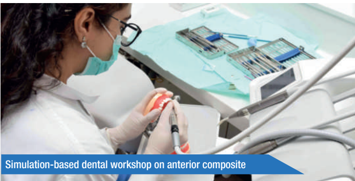
Simulation-based dental workshop on anterior composite

Weblink: https://www.aku.edu/news/pages/News_Details.aspx?nid=NEWS-002385