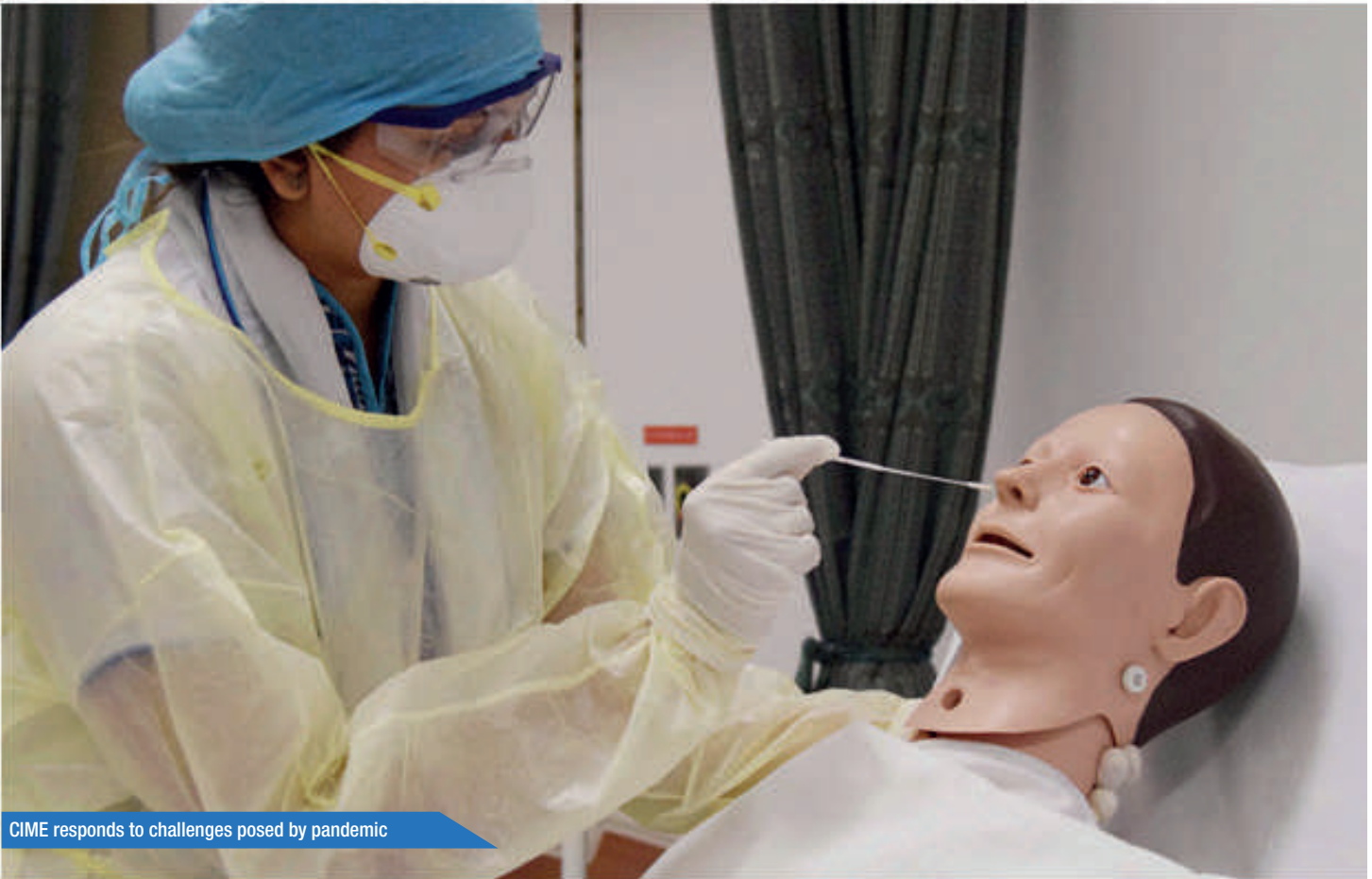
CIME responds to challenges posed by pandemic

The first wave of COVID-19 to hit Pakistan led to the need of for many more trained professionals to help care for the rising number of infected patients.