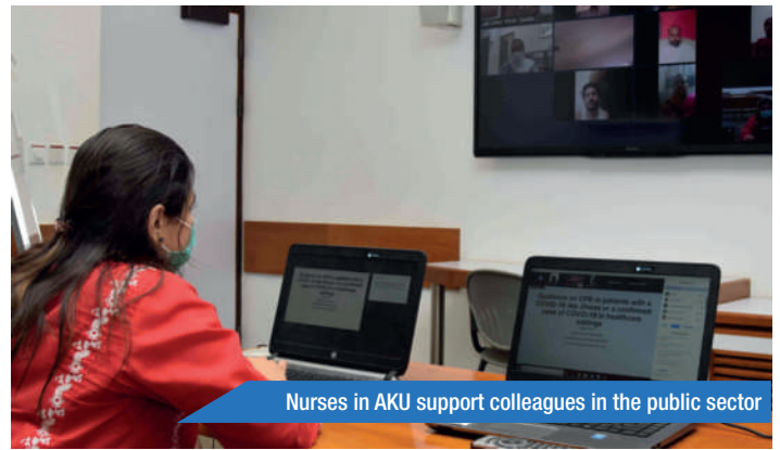
Nurses in AKU support colleagues in the public sector

Weblink: https://www.aku.edu/news/Pages/News_Details.aspx?nid=NEWS-002223