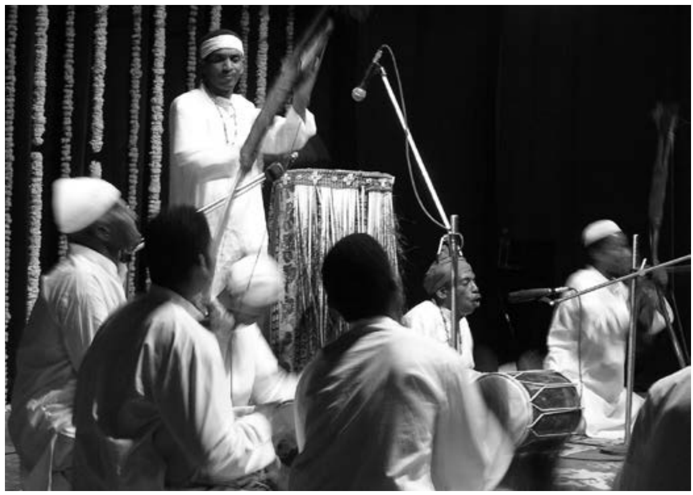
Sidi goma tour in Delhi and Calcutta, sponsored by the Ford Foundation