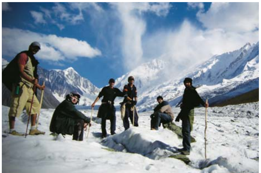
The last few steps to Tagafari base camp were the hardest.

'Likes' for our pictures on Facebook and the envy of all those who could not make it. But our journey to the mountains was a pilgrimage of sorts, where the mountain gods taught us, amongst other things, humility, and a sense of the natural beauty that exists within our very own country. It is indeed a shame that only a few can make this journey and experience a transcendence that no esoteric ritual can emulate.