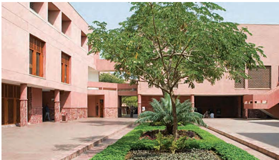
AKU Medical College courtyard, Pakistan.

about memorising facts, but it is also about finding out your consultant's likes and dislikes. It is a time when you look up to the final year students and consider them Mr/Miss Know-All and wonder in awe if you will ever be able to reach their level. Third year is all about waiting for that one rotation in ENT and Eye. Very soon you turn a page as the fourth year finally dawns.