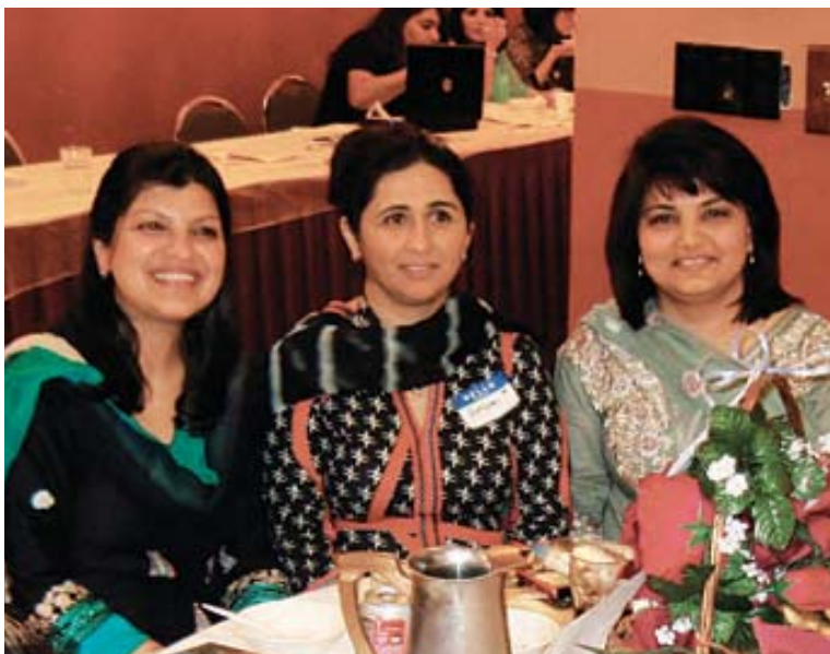
Dinner at the AKU-SON Alumni Reunion, Dallas.