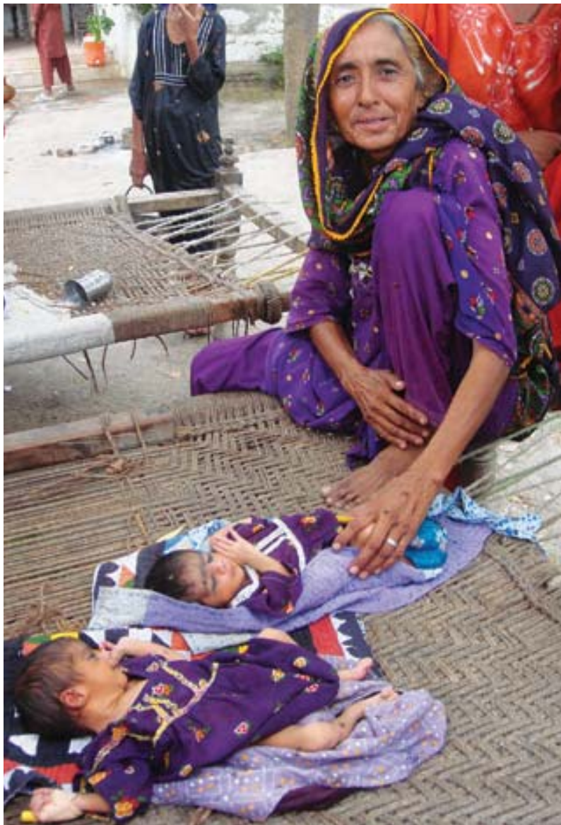
Newborn twins being treated in a school camp in Mattiari, Sindh.

During our short visit there we saw many relief efforts that could have been better. But we also saw that