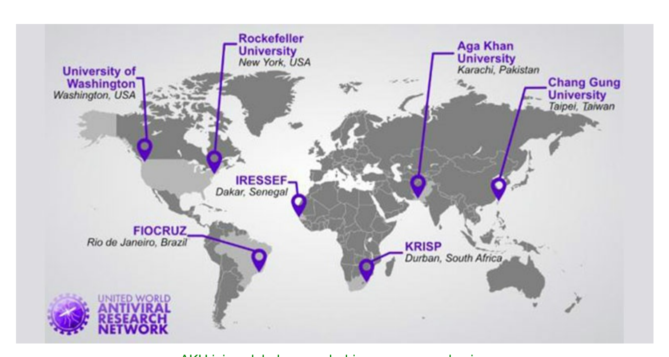
AKU joins global research drive on new pandemics