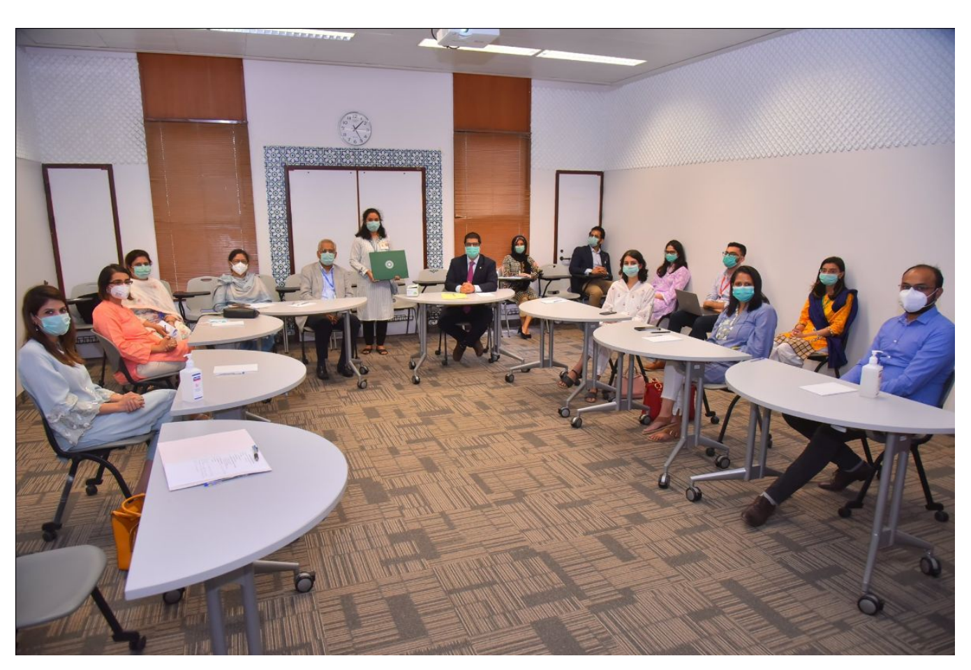
AKU and partners launch free, online mental health capacity building sessions