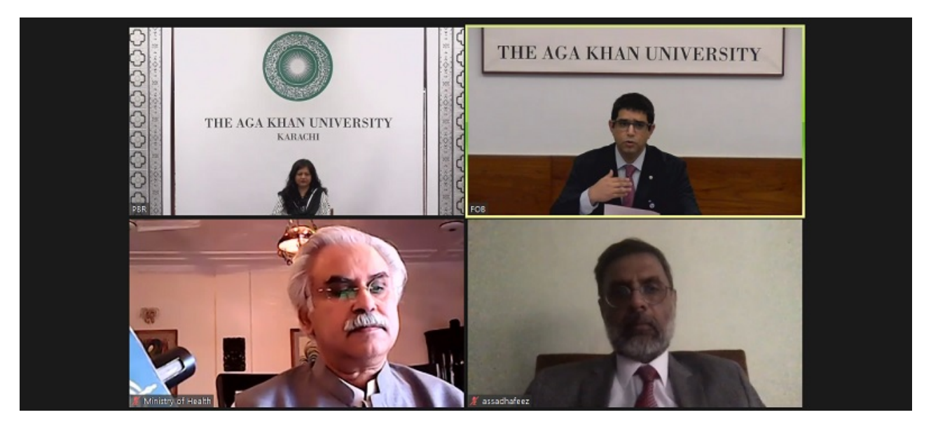
AKU and the government of Pakistan partner to boost COVID-19 critical care through trainings, teleconsultation services