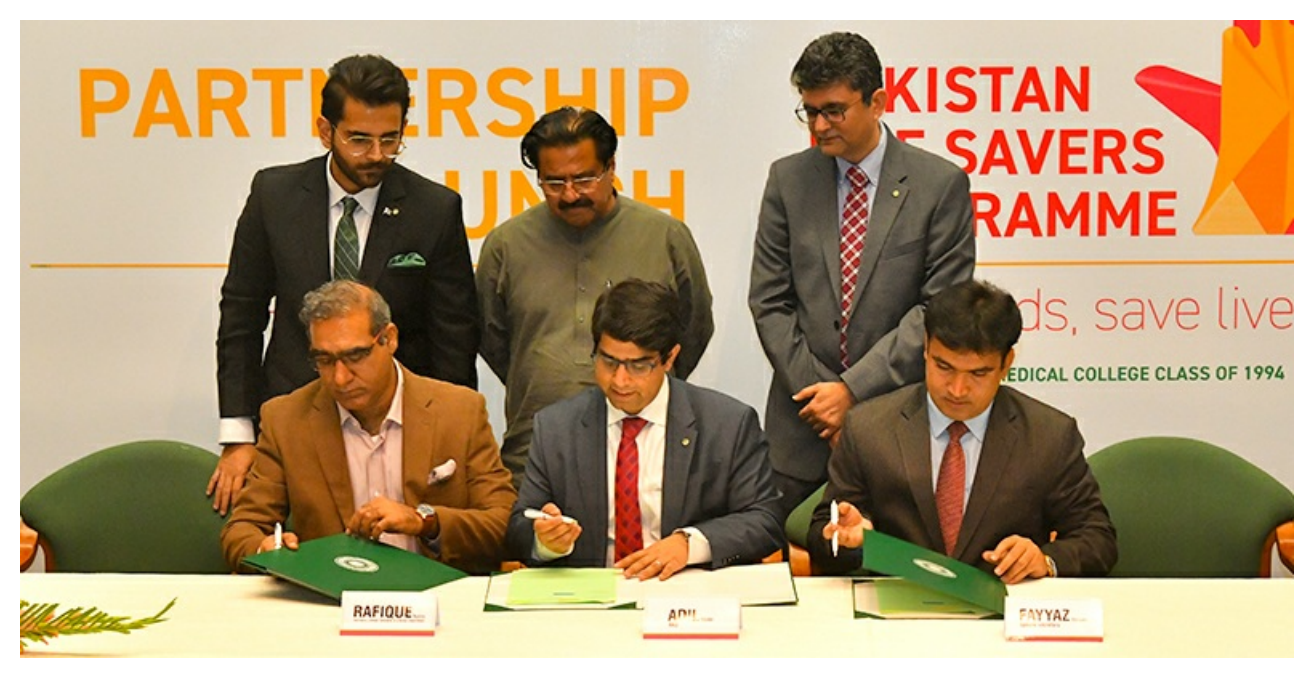
Pakistan Lifesavers Programme launched to train 10 million youth in lifesaving skills