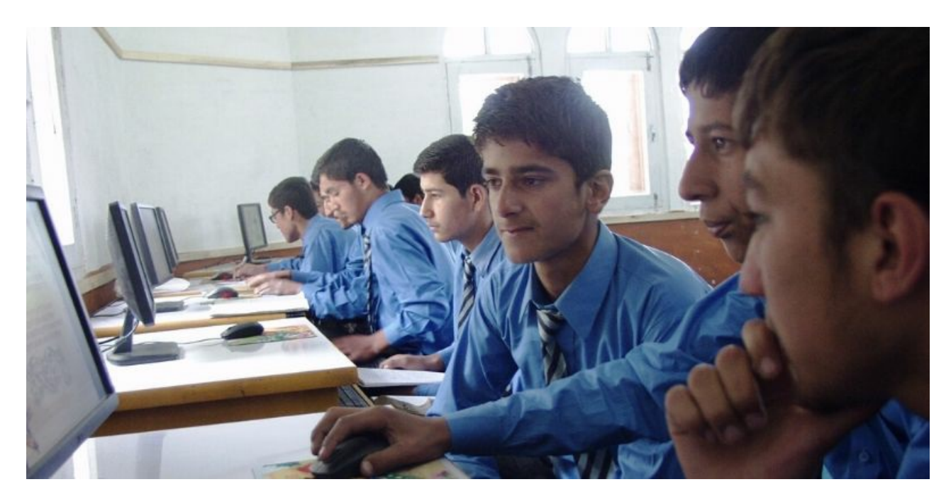
Opportunities and challenges for learning and assessment during COVID-19