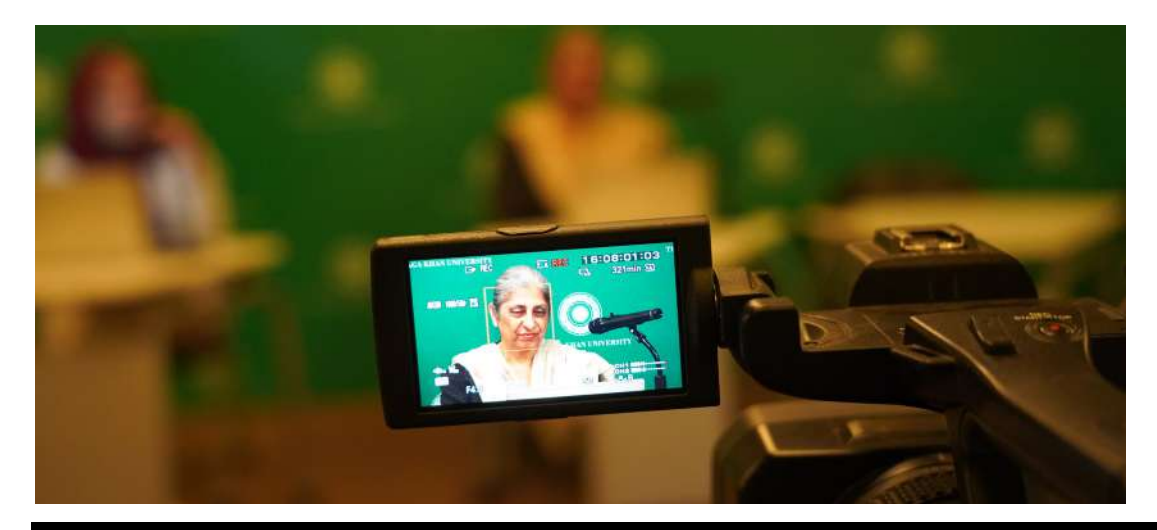
Inclusive activities foster onboarding and campus connection for students of the new Faculty of Arts and Sciences (FAS) Programme

During the in-person orientation, the 13 student societies of Student Affairs and Services took part in the now traditional welcome icebreaking event. With stalls placed throughout the medical college courtyard, student leaders of AKU provided first-hand information about their respective missions and activities, creating a welcoming atmosphere for the new students to explore and engage with different facets of student life on campus