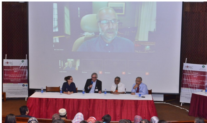
Panel discussion at AEMC 2015

Recent graduates of the program presented their thesis work. Fellows and faculty from the Khyber Medical University (KMU) attended the conference along with their AKU counterparts.