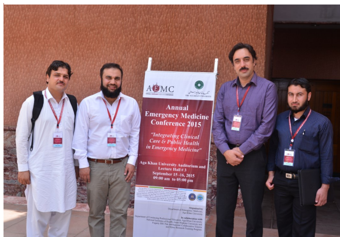
KMU faculty and fellows

More than 700 participants including national and international emergency medicine specialists, physicians, medical students, nurses and public health professionals participated to review recent advances in emergency medicine.