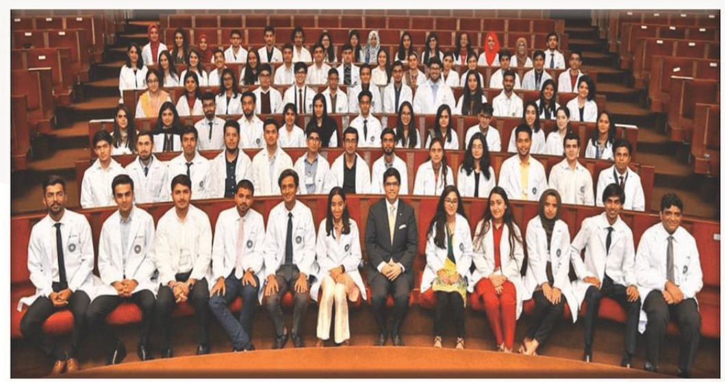
A warm welcome to the aspiring students @Class of 2024