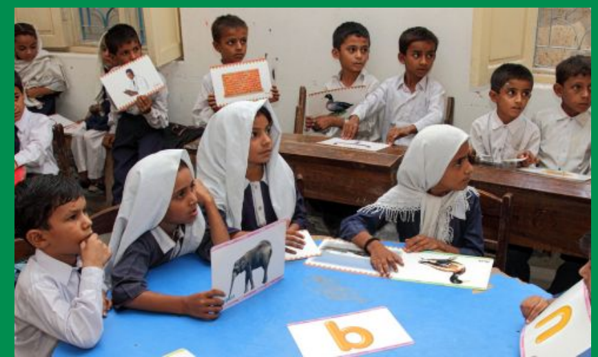
Data and Research in Education (DARE) programme in Pakistan