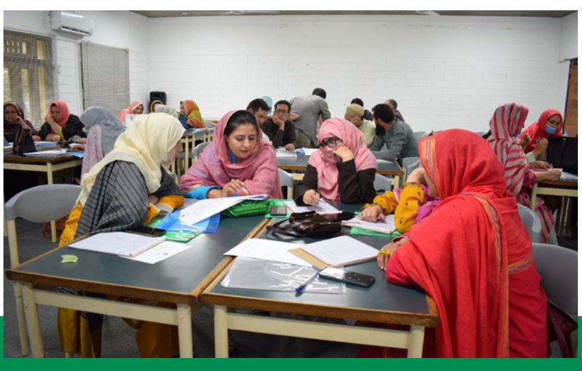
Capacity building of government science teachers in Gilgit-Baltistan Action on Environmental Protection