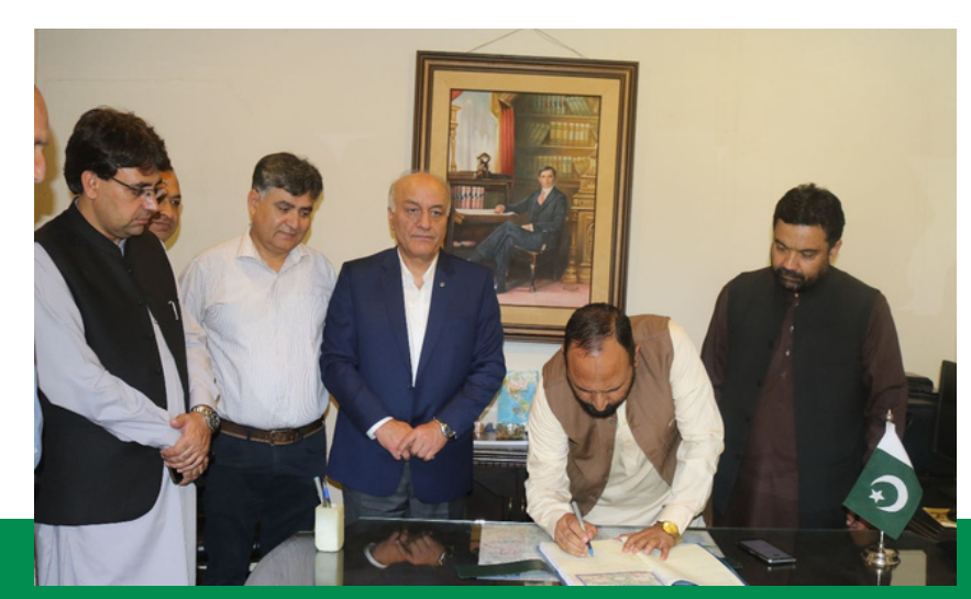
Education Fellows: Improving Quality of Pedagogy in Gilgit-Baltistan

AKU-IED secured a number of research and development project grants for implementation across Pakistan.