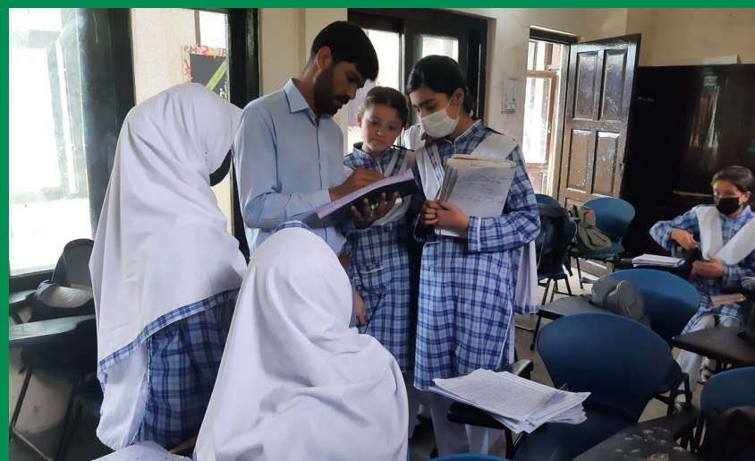
Education for Prosperity in Khyber Pakhtunkhwa