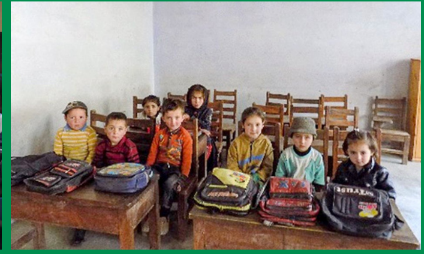
Batswat School Improvement Programme in Immit Valley