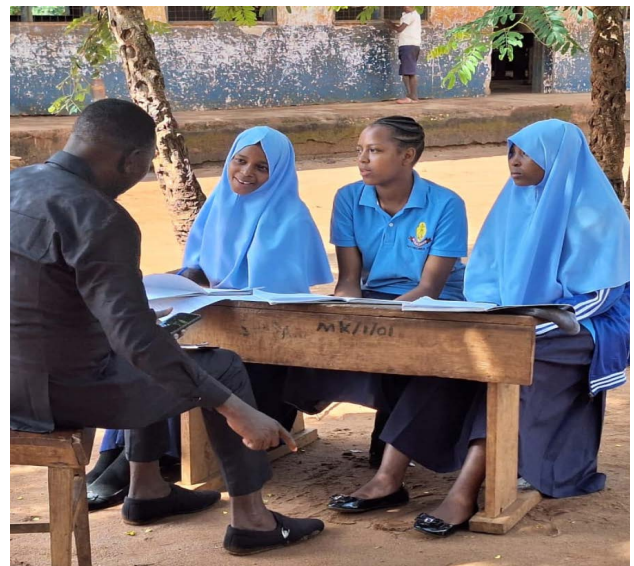
A tutor from Nachingwea Training College in Tanzania conducting a mentorship session with his students

During these visits, gender balance was emphasized in its holistic inclusion in teaching and learning. Specifically, at Nachingwea Training College, mentorship sessions continue to offer opportunities for tutors to identify areas of strength and areas of improvement.