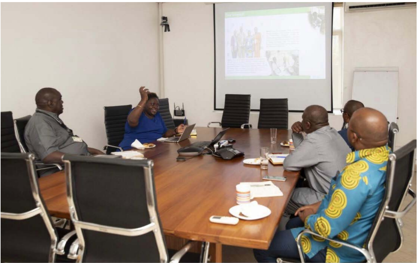
Presentation of IED, EA's impact and reach during the Permanent Secretary from MoEVT, Zanzibar visit at AKU Dar es Salaam, Tanzania