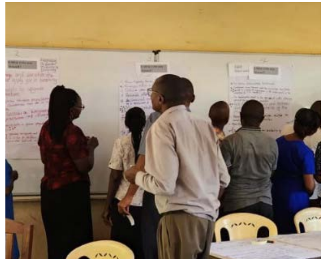
A tutor from Nachingwea Teachers College conducting a mentorship session with his students