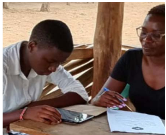
Interview sessions during data collection at Shanzu TTC Kenya

The study conducted has provided insights into effective teaching and leadership practices in Uganda, Kenya, and Tanzania, and is expected to have a positive impact on the education sector in the region.