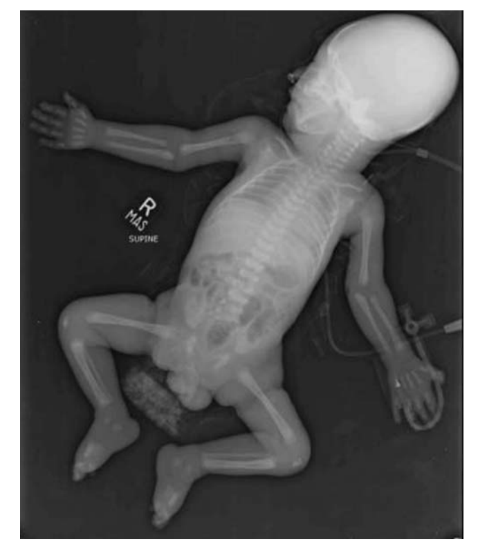
Figure-1: Babygram of Patient 3, showing punctate discrete calcification in the patella).