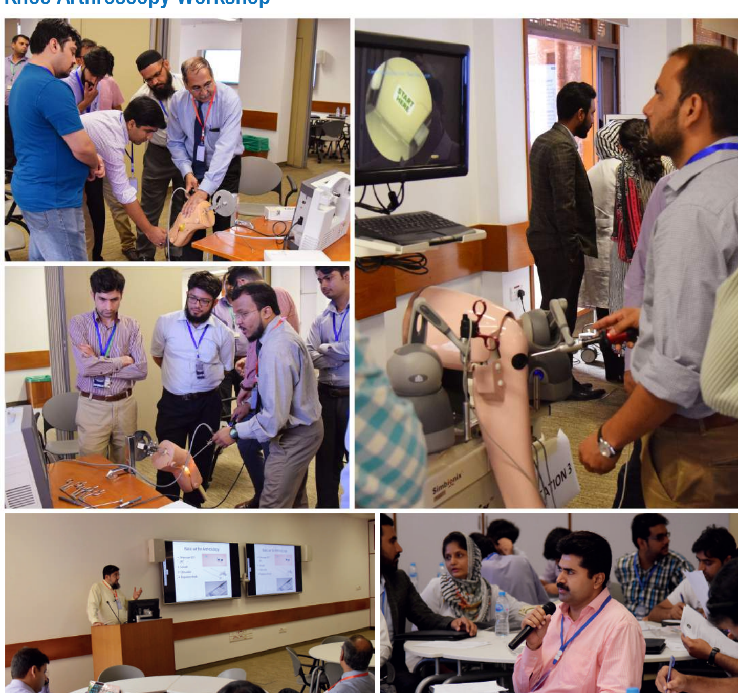
Section of Orthopaedic, Department of Surgery in collaboration with CIME introduced a one day Basic Knee Arthroscopy Workshop for Orthopaedic residents from different hospitals to teach Basic Knee surgery using Arthro Mentor (high-fidelity simulator).

The workshop began with an introductory lecture discussing the Historical Overview of Arthroscopy, Arthroscopic Anatomy, Arthroscopic Instruments, Arthroscopic Portals, Meniscal Anatomy and function, and Management of Meniscal Injuries. This workshop consisted of 4 modules which include: Basic principles of Arthroscopy, Basic triangulation skills, Basic Interventional Arthroscopy and Suture anchors.