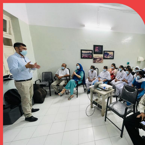
Parsi General Hospital