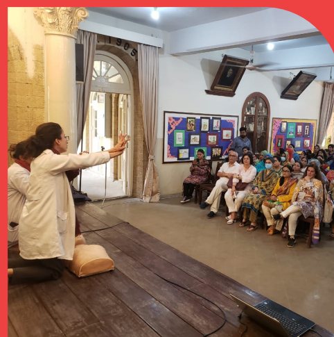
BVS Parsi School