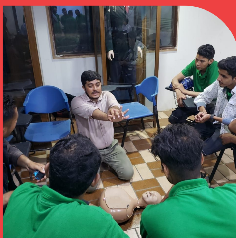
Aman Tech Vocational Institute