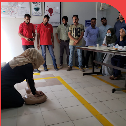
Gul Ahmed Textiles