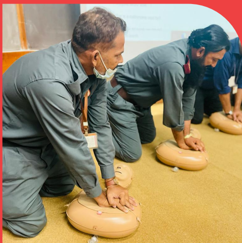
Aga Khan University

Here is a rundown on the training sessions that took place over the last three months: