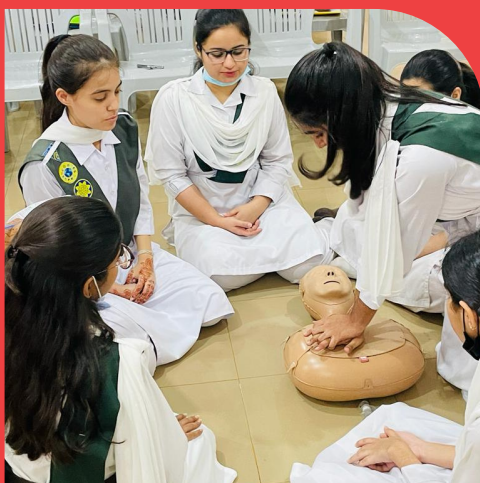
Pak Girl Guides Association