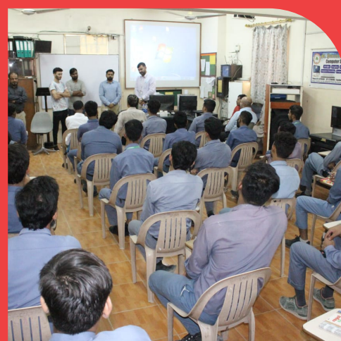
St. Patrick Technical College