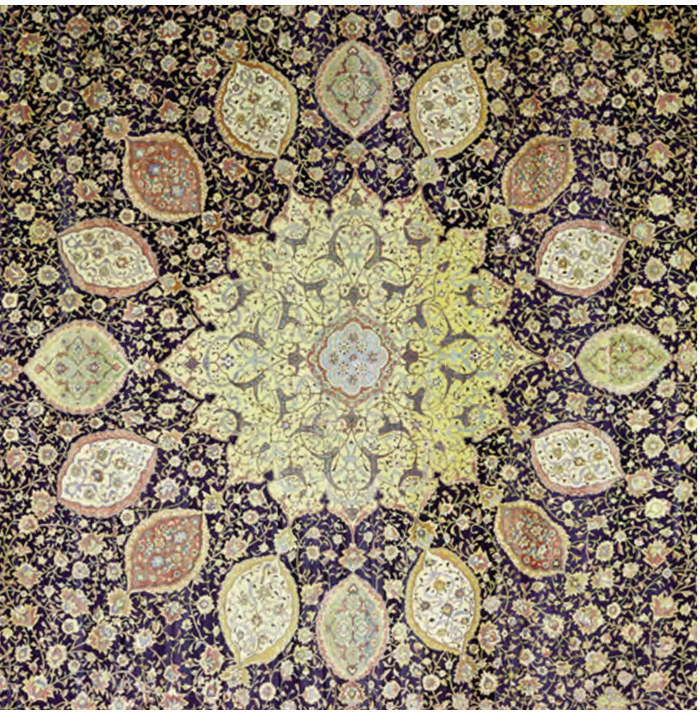
The Ardabil Carpet (detail), Iran 1539-40.

As one walks into an exhibition space, the artefacts and colours, the designs and patterns all aim to mesmerise our senses, to create an emotive response while serving as a reminder of the rich and creative history of societies – delighting the eye while satisfying the curiosity of the viewer of the evolution and environment of cultures worldwide.