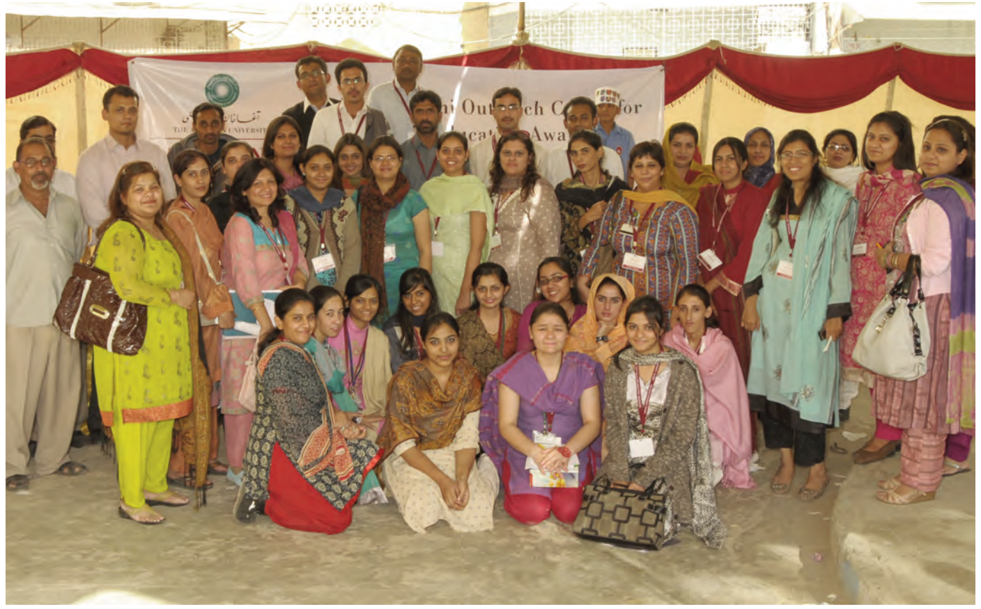
AKU alumni with support staff at Sultanabad camp after serving the community.