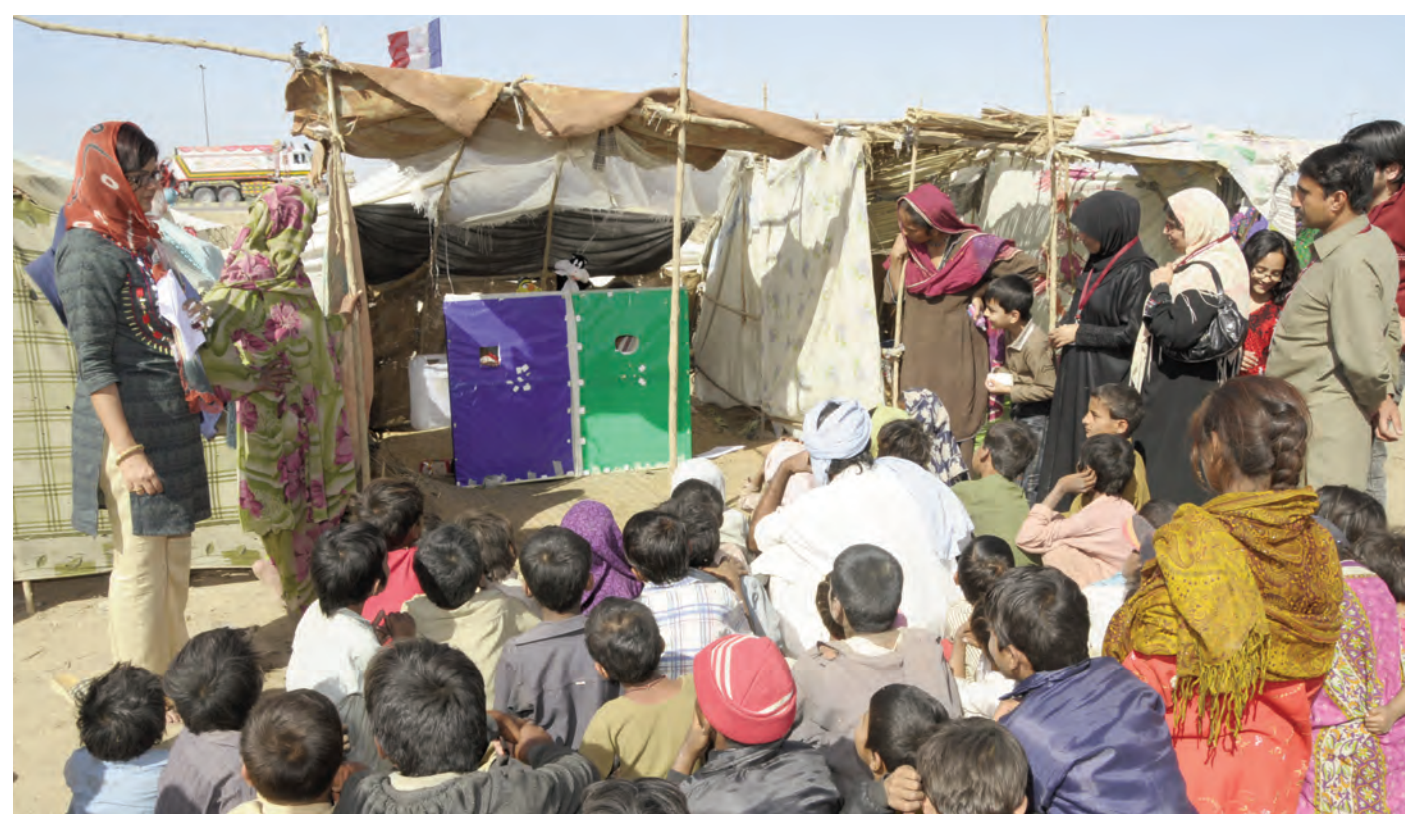
Top: Children enjoying a puppet show at an AKU alumni health camp. Left: AKU alumni explaining health education material at an outreach health camp.