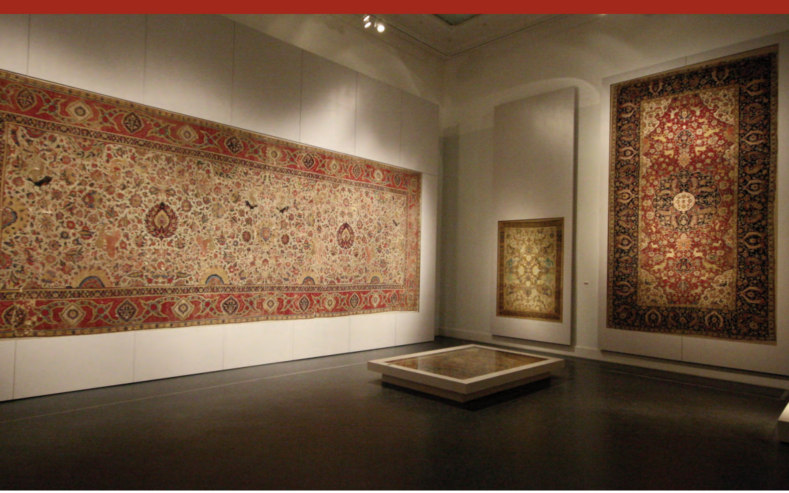
Indian and Persian carpets, 16th / 17th centuries.