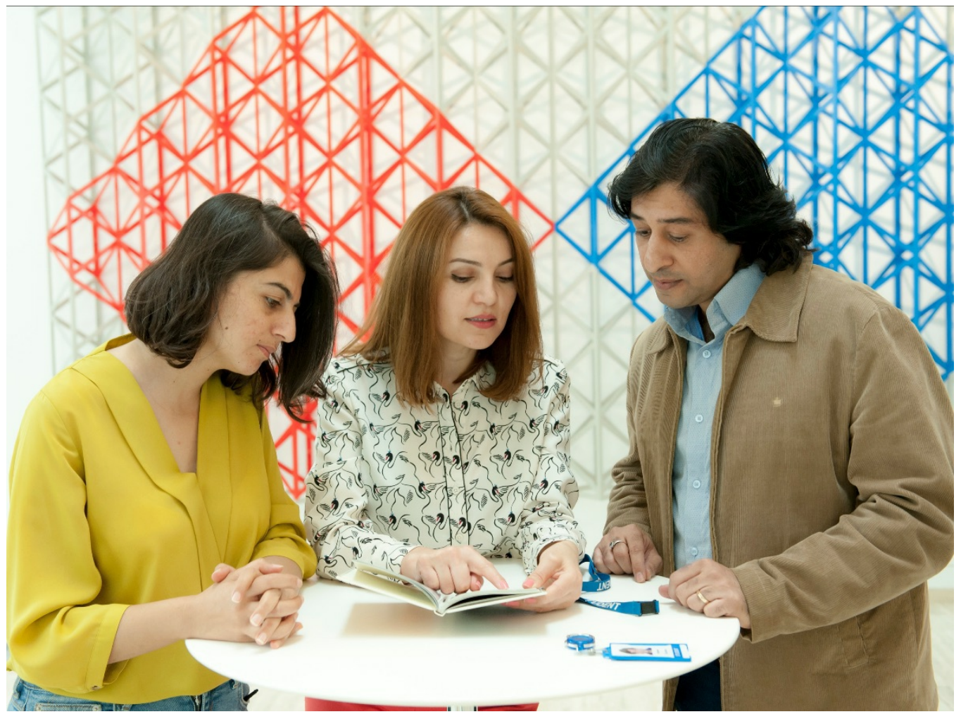
We invite applications for our popular Master of Arts in Muslim Cultures.

This programme offers students a world-class interdisciplinary educational opportunity with renowned scholars in the humanities and social sciences. Deadline for applications is January 31 2020. Click here to apply