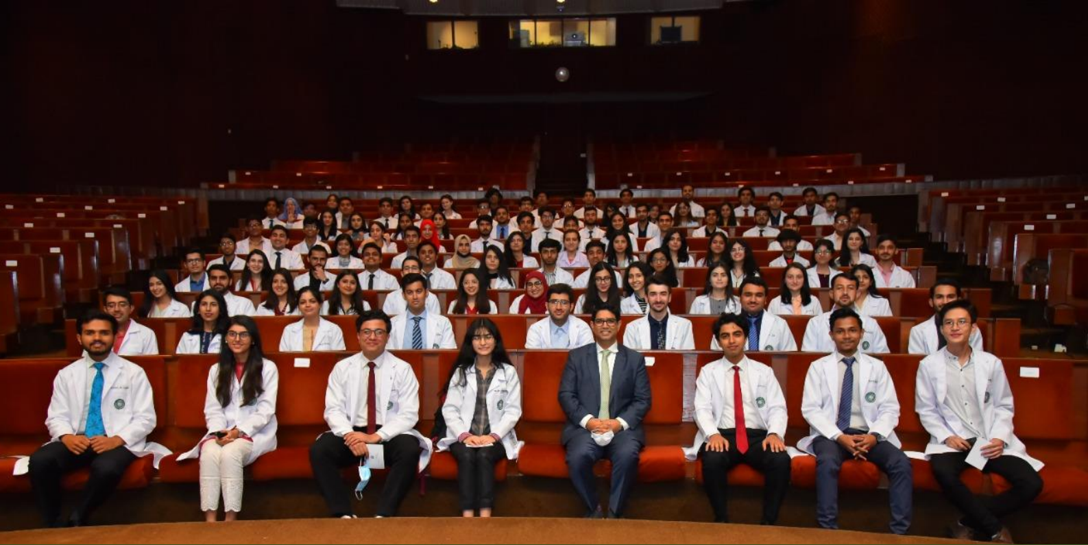
Class Picture on DAY ONE