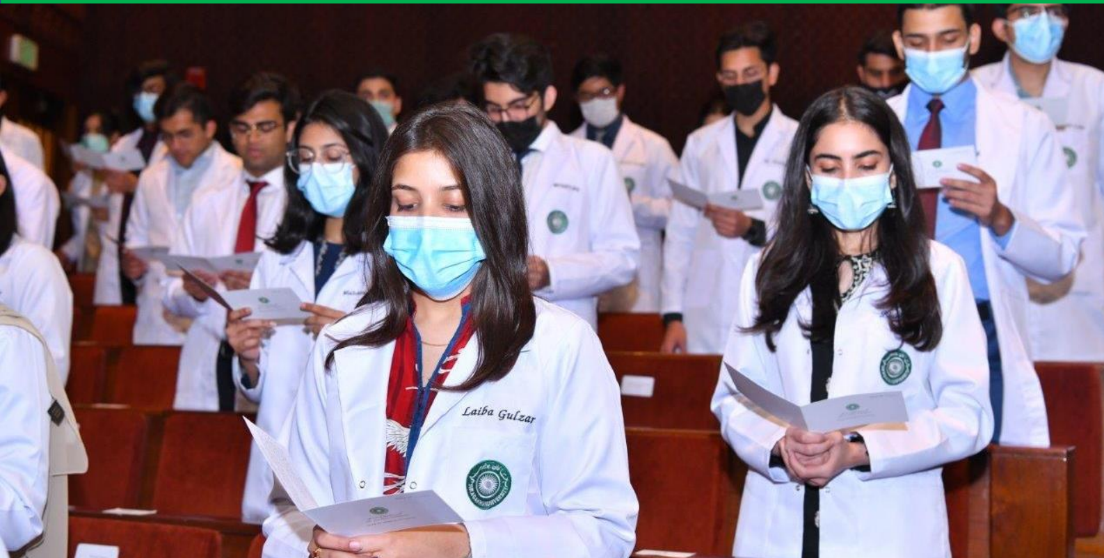
Student White Coat Ceremony