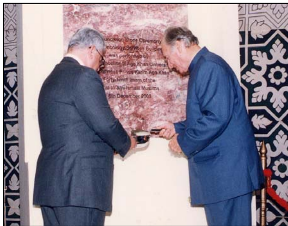
The Chancellor lays the foundation stone for a new Oncology Services Building in Karachi.

On land adjacent to the School of Nursing, the Karimi, Noor and Arman Rupani Residences are providing a home for 150 professional women from Pakistan and abroad in the secure environment of the Stadium Road campus. Blending architecturally with other University buildings, and set in quiet, pleasantly landscaped surroundings, the Residences are a major factor in attracting women professionals who otherwise may be hesitant to live in Karachi. Built at a cost of US$6.3 million, the Residences were funded by the Karimi family of Atlanta, the Rupani family of Dallas and the Mewawalla family, in addition to a US$300,000 contribution by the University.