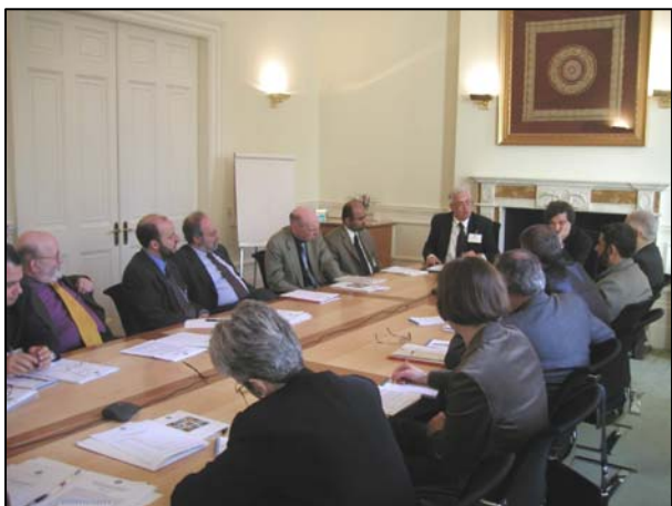
Renowned international scholars gather at AKU-ISMC to deepen understanding of pressing issues of public life in Muslim societies.

In Afghanistan and Syria , both the School of Nursing and the Institute for Educational Development in Karachi are providing faculty, technical assistance and advisory services to government institutions to build capacity in the fields of teacher and nursing education and nursing practice. In Central Asia, the Institute is providing technical assistance to the government-owned Institute for Professional Development in Khorog, Tajikistan .