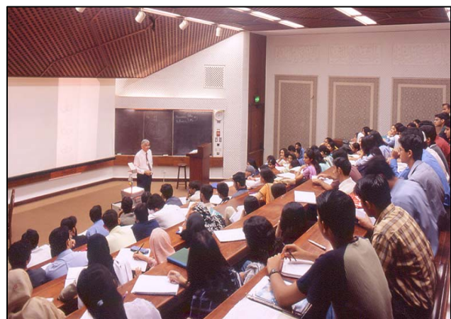
The Faculty of Arts and Sciences will equip students with skills, ethical commitment and leadership qualities for their future careers.

You will be pleased to know that the Chancellor's vision is being realised with the start of planning and architectural design for Aga Khan University Faculty of Arts and Sciences . It will be built on what was originally a new 600-acre campus on the outskirts of Karachi, but which will now be an 1100-acre campus as a result of an additional 500 acres being allotted for the University's use by the Governor of Sindh. The Faculty of Arts and Sciences will offer high quality, general education to students from all over Pakistan, Central and South Asia, and East Africa. Its objective, as expressed by the Chancellor, will be to ". . . equip