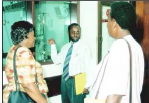
The Advanced Nursing Studies Programme in East Africa trains nurses for increasingly important roles as members of the health care team.

AKU's Advanced Nursing Studies Programme is in operation on three campuses in Kenya, Tanzania and Uganda. This initiative marks the first time in the history of health education in East Africa that a private sector institution is offering degree programmes in nursing. Aimed at providing new continuing education opportunities to practicing nurses, AKU in East Africa offers programmes leading to the Advanced Clinical Specialist Diploma, conversion from Enrolled Nurse to Registered Nurse, and undergraduate studies for a Bachelor of Science in Nursing. Currently 257 nurses are enrolled. This number is expected to jump to over 400 within two years.