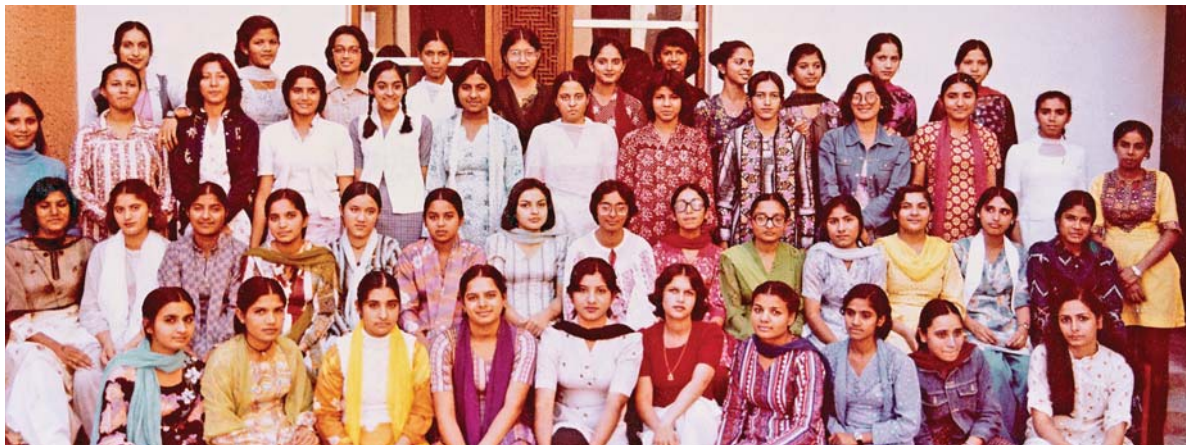
Setting the trend, the first batch of nurses helped transform traditional thinking about the profession