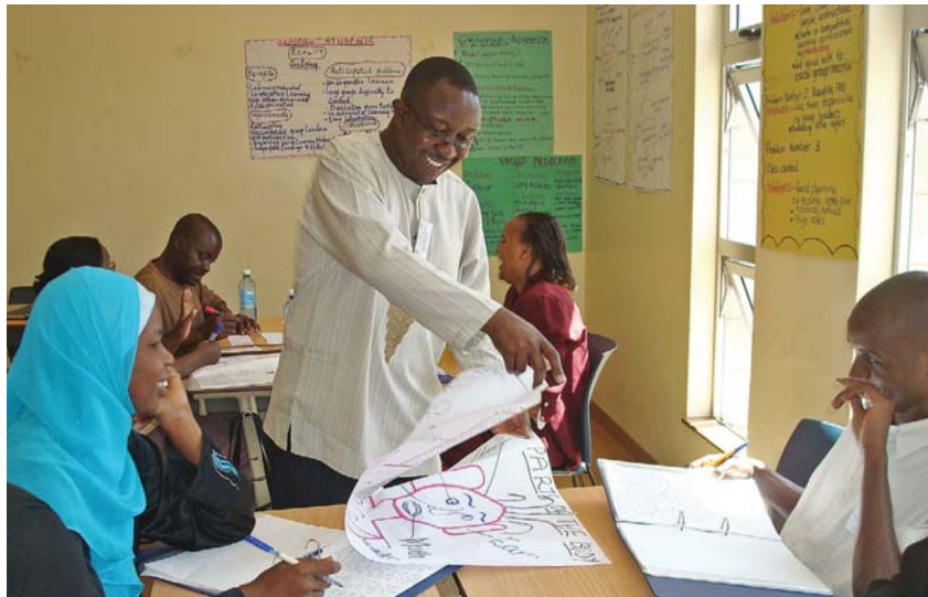
As a result of Kiforo’s efforts an increased number of teachers have enrolled in the MED programme at IED

levels through class observation and post-observation conferences.