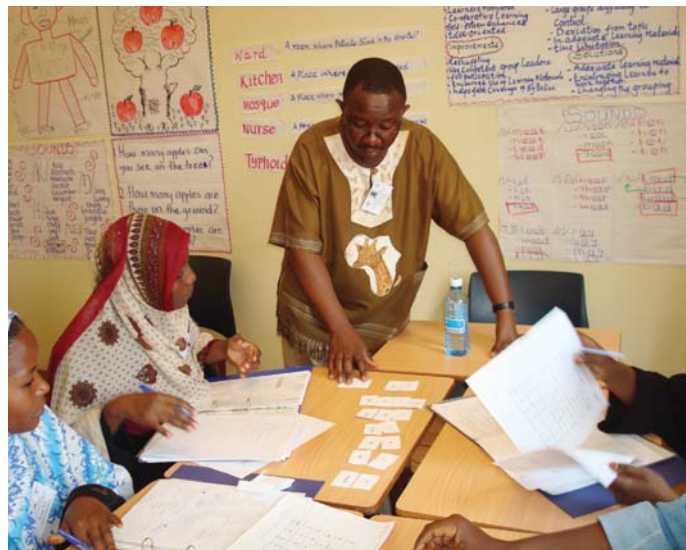
Cooperative learning techniques are at the heart of professional development

According to him though his greatest achievement was the implementation of his Information and Communication Technology (ICT) action plan, which he had drawn up as part of his assignment in one