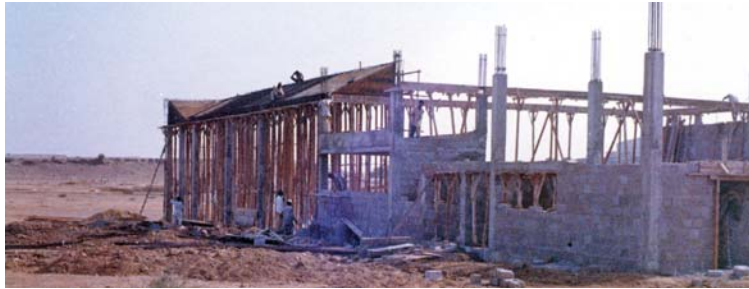
With barren land stretching all round, the School of Nursing was the first building to be constructed on campus