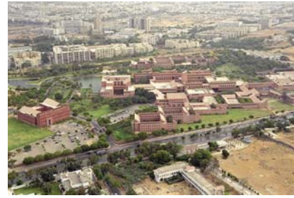
The campus in the early 2000s