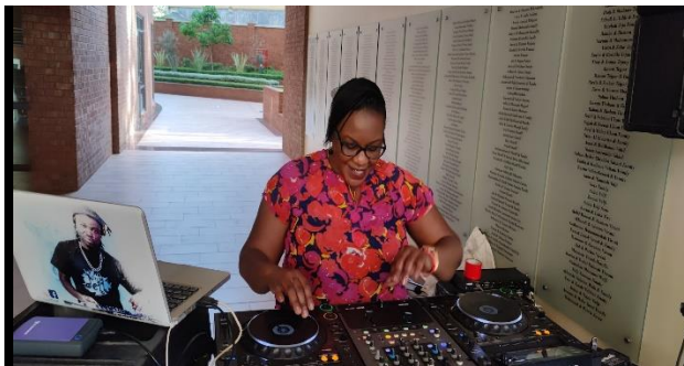
Fig 3. Photos of End year farewell party 2022