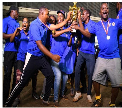
The winning team (there were four teams from all AKU / AKUHN departments)